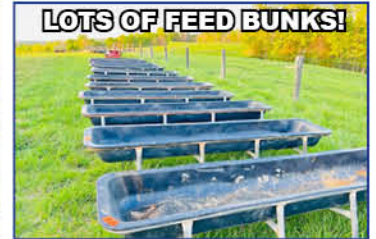
LOTS OF FEED BUNKS!