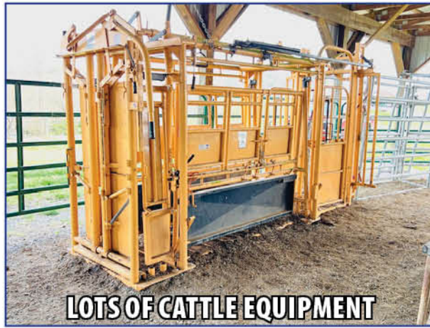
LOTS OF CATTLE EQUIPMENT

Accepted methods of payment are cash, local check (w/ I.D.) – out of town buyers must pay with confirmed cashier's check or wire transfer for main equipment - OR Visa, MasterCard or Discover with a 3% processing fee in person (minimum processing fee of $3). All purchases that have not been paid by Friday May 8th at 5 P.M. CDT will automatically be charged to the credit card used at registration, with a 4% processing fee (minimum processing fee of $3). See full terms & details upon registration.