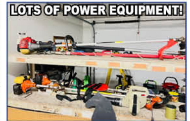
LOTS OF POWER EQUIPMENT!