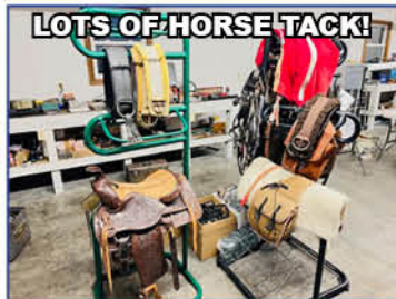
LOTS OF HORSE TACK!