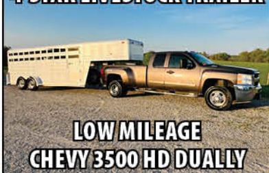
LOW MILEAGE CHEVY 3500 HD DUALY