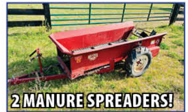
2 MANURE SPREADERS!